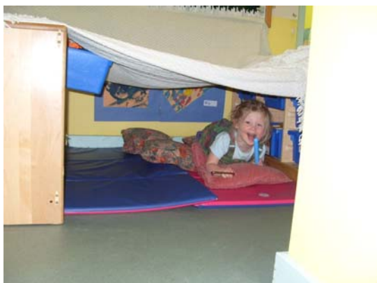
Can you find me?

We have been building dens and hiding places with Val's big boxes that she has been moving house with. It was so much fun, when it was sunny we took them outside too.