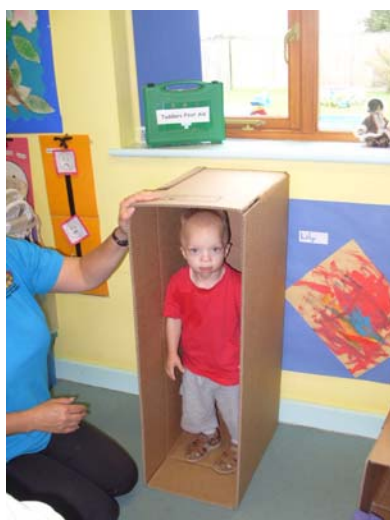
A first class delivery

But that didn't last long as we got distracted by all the bugs and beasties that we managed to find hiding in the garden. We especially liked the slug and the lady birds.