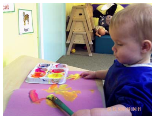
I like this paint stuff!

We have so many babies we are quite literally booming. It's so great to have so many beautiful smiley faces everyday and we have thoroughly enjoyed the summer months. We have made the most of the good weather. We particularly enjoyed visiting the farm animals at sports day.