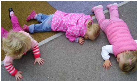
The girls having a snooze

If any of you have a Meg and Mog story book, could we please borrow it? We will be very careful, promise. If not you can use a Meg spell and turn me into a pumpkin.