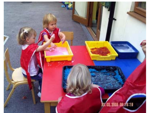
All gooey and sticky

Firstly a big thank you to those that donated for Jeans for Genes day we raised £45. The children thoroughly enjoyed our day of activities and we had lots of fun cutting up your old jeans.