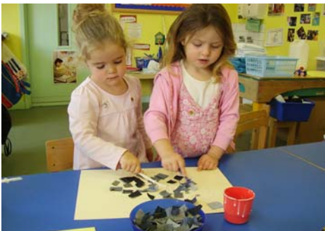
Creating a lovely denim collage

The Jeans for Gene's day was a great fun day and the children's art work is displayed in the entrance hall. Please do take a look.