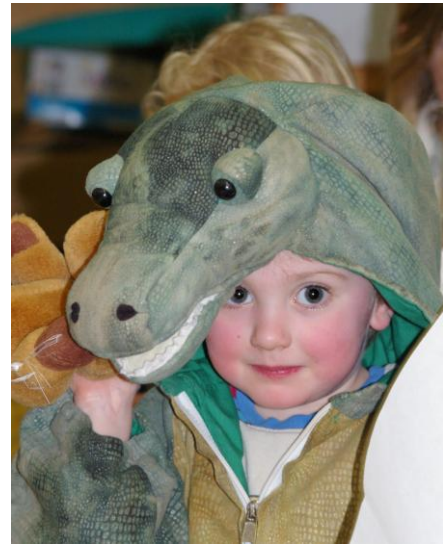
Do you think they know it's me?