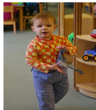
I can fix it!

We still have lots of potted Daff's to send home so please bring in your Marie Curie forms. Thank you for all the amazing donations so far, we are really thrilled.