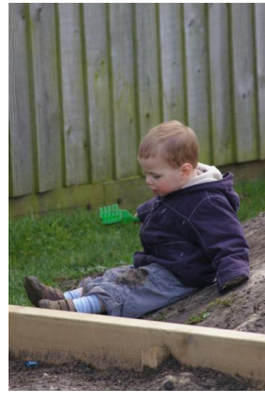
Will I get away with the mud on my trousers?