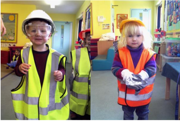
We look so cool!