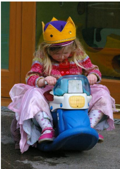
I'm a Princess everyday.