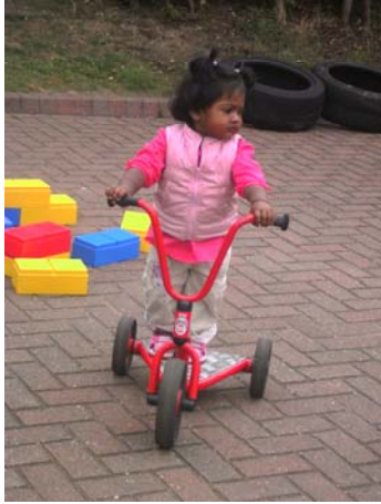
Make way, I'm coming through!!

The children have also enjoyed the outdoor environment racing around like rockets, playing with the parachute and practising riding the bikes.