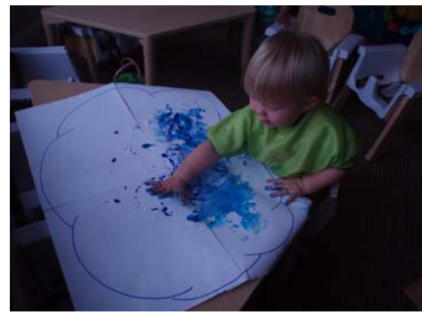
Izzy, Whizzy, Lets Get Busy!

This month we have been learning about summer time and transport. We have participated in lots of creative activities which are on display around the room, such as 'how do we go on holiday' and 'in the adventure playground'