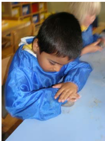
Making our own Diva Lamps out of clay

With all topics we are always able to incorporate a variety of cooking activities, and this month has been no different. We have made different kinds of bread including naan bread, which we all tried and ate with our afternoon tea. As always it was very yummy!