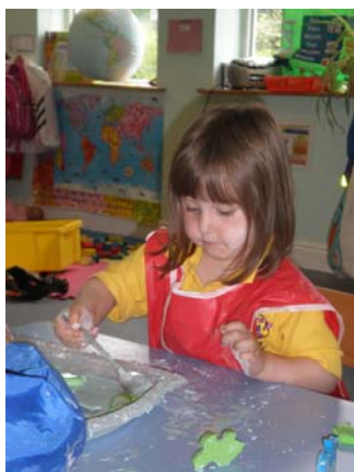
Come and feel this...

Messy activities have included oblique- a mixture of cornflour and water, sand play and painting and printing with a variety of different objects and materials.