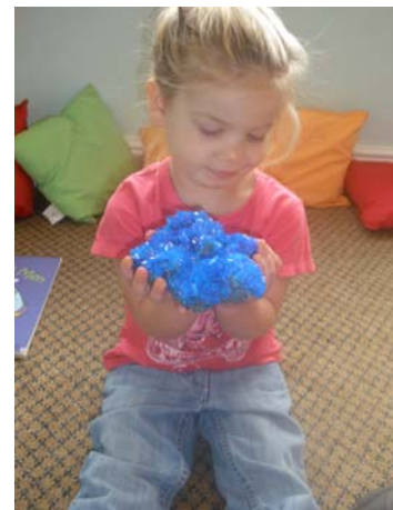
Holding the Moon Rock

With the weather being reasonable for the majority of the month, we have made the most of being outside in the fresh air. We have enjoyed learning how to ride the scooters and the bikes, and have learnt new songs like ring a ring a roses which some of our older brothers, sisters and friends have taught us.