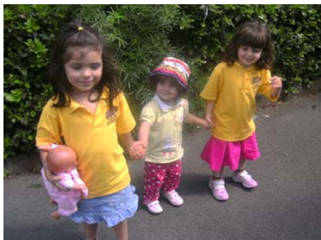
Ring a ring a roses.....