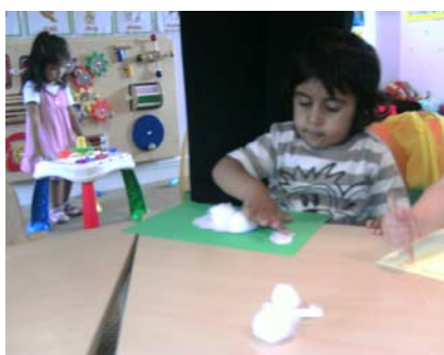
Baa, baa pink sheep have you any wool?

We have also looked at some nursery rhymes such as 'baa baa pink sheep' the children had great giggles making there own interpretation off a sheep.