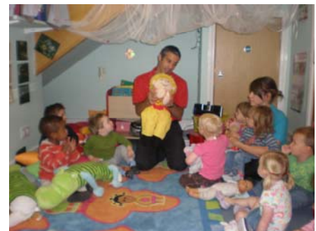
Join in and have fun!!!!

Jo Jingles has really settled in well and the children are enjoying his company lots. Jo provides fun music, singing and movement classes for our babies, older babies and toddlers, offering a series of varied educational programmes. For further information on these music sessions please see the leaflets and parent packs that are displayed in the foyer area.