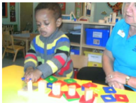
Completing a shape and colour puzzle

Within the Toddler room this month we have had great experiences learning about shapes and colours.