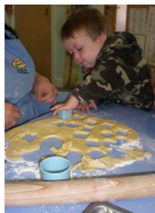
Which shape shall I use?

We have been shape sorting and colour sorting objects into the right category, made shortbread shapes making the dough ourselves and cutting out with our chosen cutters. Later on in the day we then made coloured icing to spread all over the top!