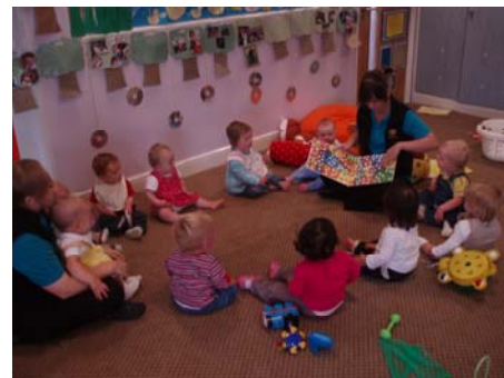
Enjoying our favourite story

During our story and circle time our favourite story has been "Fred's Baby Animals". It's a story where we can make lots of noise where we learn the different animal sounds and we also loved to sing along to 'Old Macdonald'.