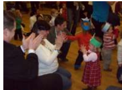
Mummies and daddies joining in the fun!

up and down. It was great fun seeing where the frog would end up!