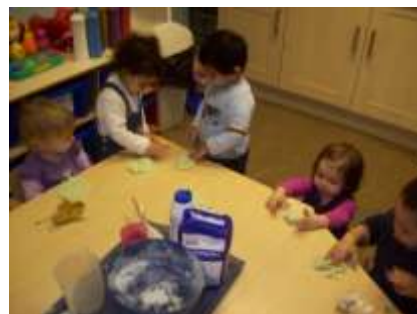
Making our salt dough

In the middle of December we dressed the children as snowmen to make special snow globes for presents, which, went along with their Christmas cards and calendars.