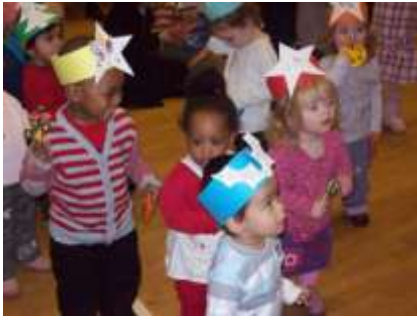
Here we are, dancing!

We all agreed that the messiest game of all was the 'cake eating' at the end!!