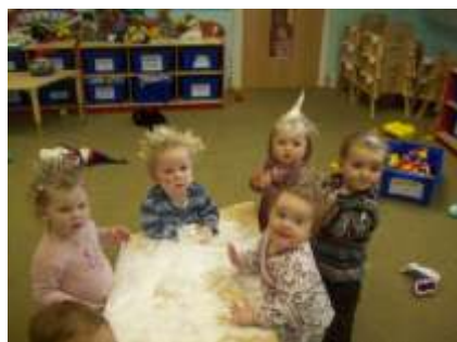
Look what we do with shaving foam!

There is one activity that the babies really have fun with which involves shaving foam. We place the foam on the table and the babies splash their hands in it and use their fingers to make patterns. They also like to rub it in their hair and with a little help from staff, can create some wonderful hairstyles!