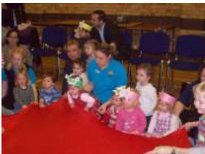
Trying to catch the frog.