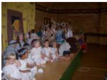
'Whoops a Daisy Angel'