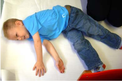
Posing as a lion for our jungle wall....

Preschool has had another busy, busy month. We have created an incy wincey spider display, including a painted rainspout and quite a l-a-r-g-e spider! We blew up latex gloves and tied them with elastic bands to create our own individual spiders as well. We created our own bus, complete with rotating wheels and photos in the windows for the rhymes 'The Wheels on The Bus'. We learnt new nursery rhymes and acted out many types of role play to our favourite stories, including dressing up as the characters.