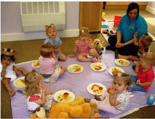
What a great time we had at our Teddy Bears' picnic!!

headoffice@positivestepsnurseries.co.uk There will be a deadline on the invoice for contacting us with regards to changing any of the payments. We will then be able to correct our paperwork before we actually call for the fees via direct debit from your bank. Payments will be taken as per the invoice unless contact is made to head office to advise us of any change. We cannot be responsible for any charges accrued due to direct debit being taken.